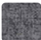
Cushion: SF - 1105