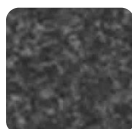
PET Panel: GP - 04