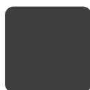
S - 211 Black