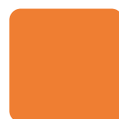
S - 169 Orange