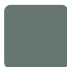
S - 201 Green