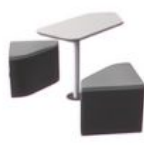
E5 : ST9 + SY9