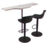
F3 : ST3 + S1