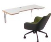
F4 : ST4 + SY2