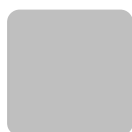
S - 235 Silver