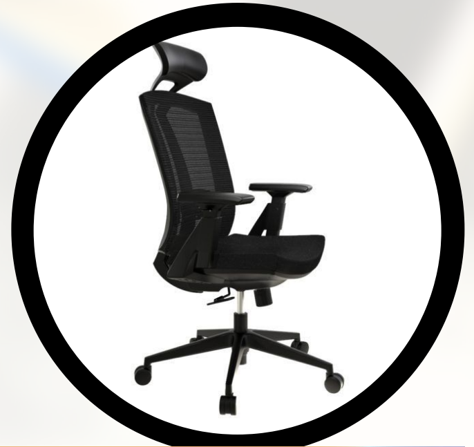
SUNLINE ERGO +